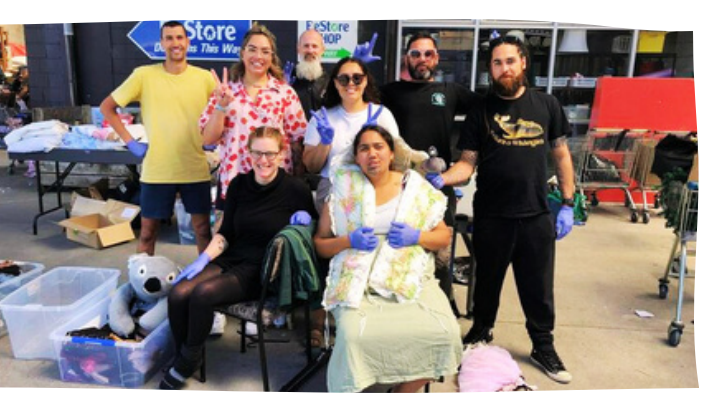
GDC & HABITAT RESTORE / TEAM OPPORTUNITIES