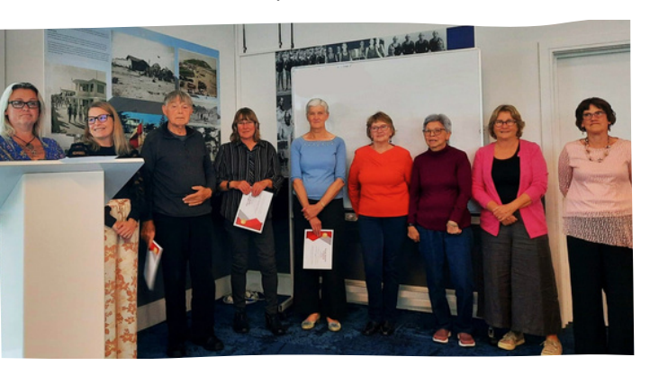
SUPERGRANS / IVD AWARDS NIGHT